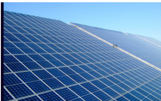
Solar Panels at Winery

Whether a single vineyard Reserve or a unique blend of diverse fruit, Powers wines have always been priced to provide exceptional value to consumers. For more than 20 years the winery has continued to increase production and our wines are now available throughout the United States, select Canadian Provinces, many European countries, and some parts of the Pacific Rim.