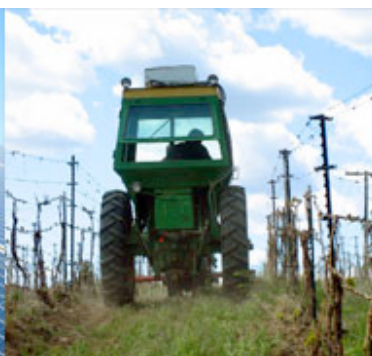
Certified Organic Estate